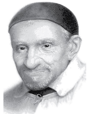
St. Vincent de Paul

Vincent's biographer recounted that the last word he uttered on his deathbed was "Jesus."